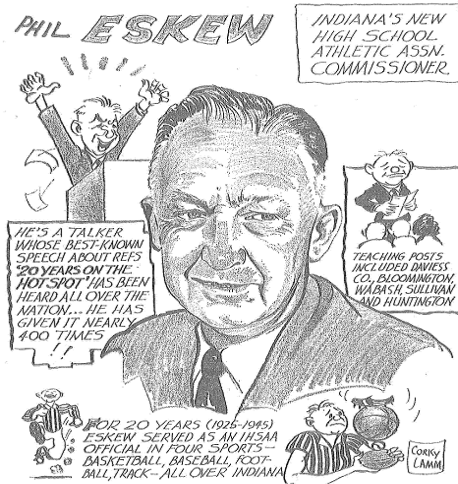
Fig. 1 34

When asked, “Doesn’t it hurt?” the young runner answered, “Of course it hurts!” But he won his race because he had “fight.” To young athletes, Eskew promised, “You will grow up to be a bigger person because of your participation in athletics.” 33