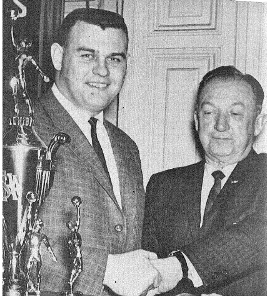
Fig. 2 63